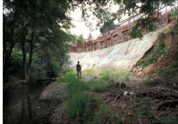
Armored bank on San Anselmo Creek near Madrone Avenue

Wildlife observations were incidental to other observations. Aquatic species noted were: trout; roach; three-spine stickleback; and crayfish. Deer were frequently encountered, often with fawns.