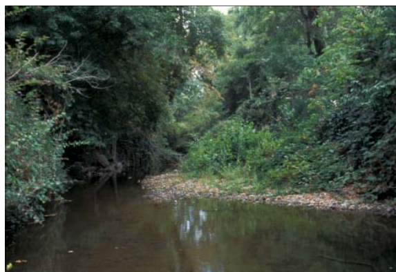
California bays and big-leaf maples overshadow San Anselmo Creek on the Drake High School campus

Native trees made up 82% of the total tree count of 1563, and consisted of nine species: California bay (36%); white alder (18%); native willows (14%); valley oak (9%); box-elder (7%); buckeye (7%); coast live oak (4%); Oregon ash (3%); and big-leaf maple (2%). Alders were in the majority (36%) on the mainstem creek, while the only ones on Sleepy Hollow Creek had been recently planted for bank protection. The creek corridor is the principal refuge on the valley floor for native trees; in aerial views of the valley, the course of creeks can be followed by observing where the tall-growing valley oaks and bays are found. (A scattering of large valley oaks not associated with the