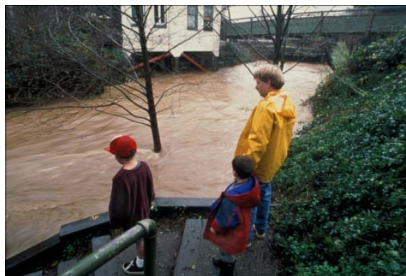
High water in Creek Park, 1997

Gardening activities have their impacts on the creek side of the fence too: ornamental shrubs and groundcovers often escape onto the creek bank; fertilizers and pesticides move towards the creek; garden debris is frequently dumped over the fence; and some homeowners withdraw water from the creek, at the expense of aquatic life. Where vegetation is unable to stabilize the bank, many homeowners, in an effort to protect their property from erosion, have armored the creek bank with wood, concrete or rock structures. In an effort to prevent flooding caused by logjams, all fallen trees and most brush is removed from the creek bed, to the detriment of fish habitat.