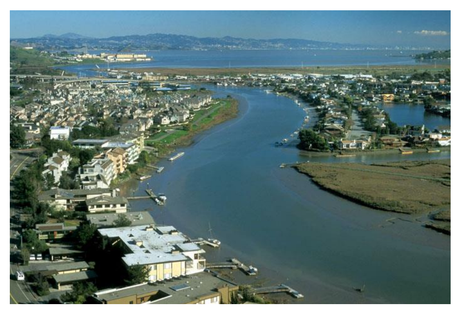
In earlier days, Corte Madera Creek was a busy shipping route serving San Francisco. San Quentin is seen at the top left.

In the 1840s two sawmills constructed at the mouth of what became Baltimore Canyon in Larkspur provided lumber for booming San Francisco. Mill employees stripped southern Marin's hills of redwoods, milled the lumber which was then hauled to Ross Landing (near the