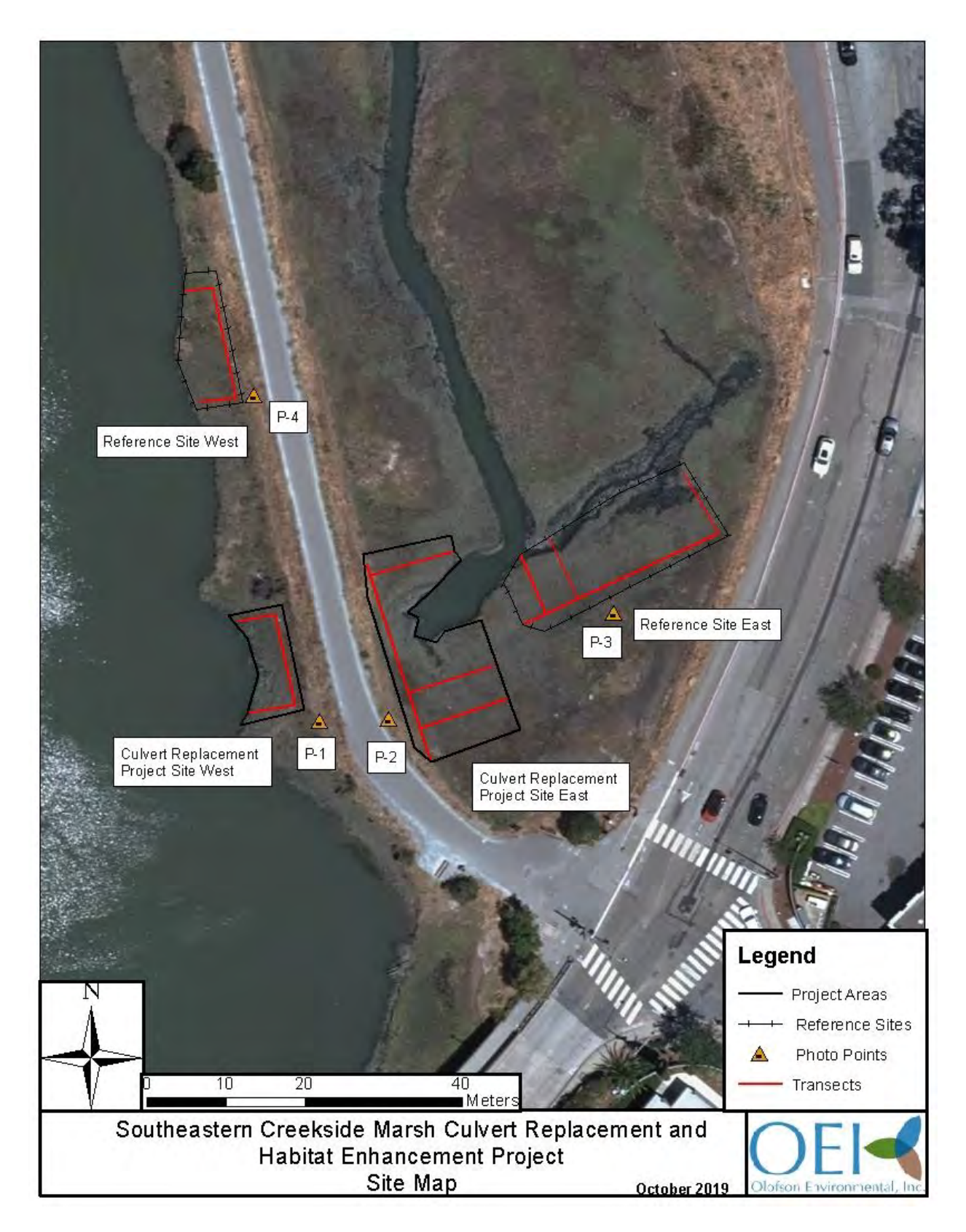
Figure 2. Culvert Replacement Project Site Map

Southeastern Creekside Marsh Culvert Replacement and Habitat Enhancement Project Year-6 Annual Monitoring Report