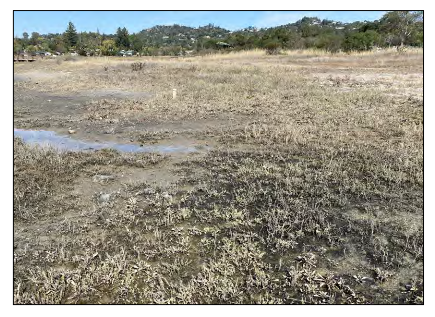
P-8. Reference Site: Soil Amendment Site