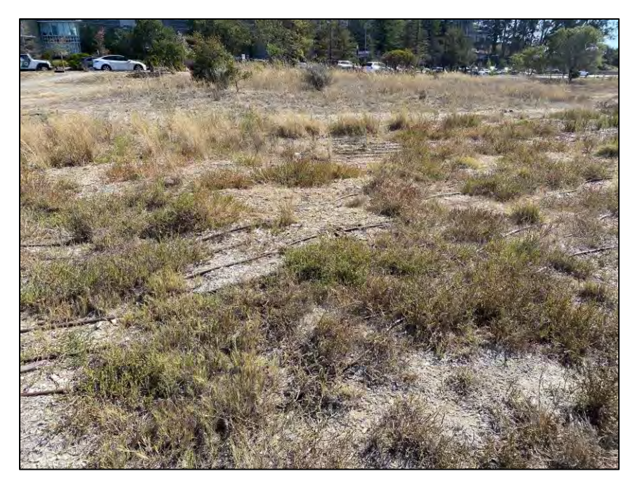
P-7. Project Site: Soil Amendment Site