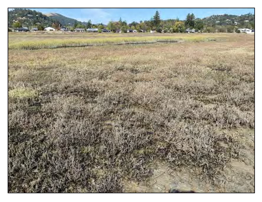
P-6. Reference Site: Soil Replacement Site

P-5. Project Site: Soil Replacement Site