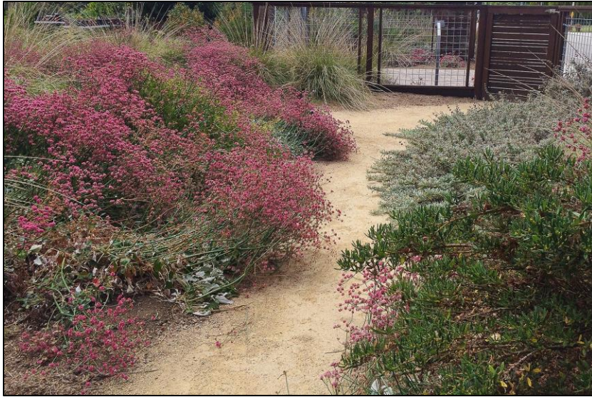
An informal path of decomposed granite is an environmentally friendly alternative to concrete.

can soak through it, preventing pooling and puddling and the resulting cracking. The Central Marin Police Station in Larkspur has permeable paving in the parking lots. You would never guess it isn't standard asphalt; it looks much the same. Other options include using brick or stones set in sand on a gravel bed for some portion of the pavement, or simply considering just how much really needs to be paved and if some could be returned to lawn and garden beds.